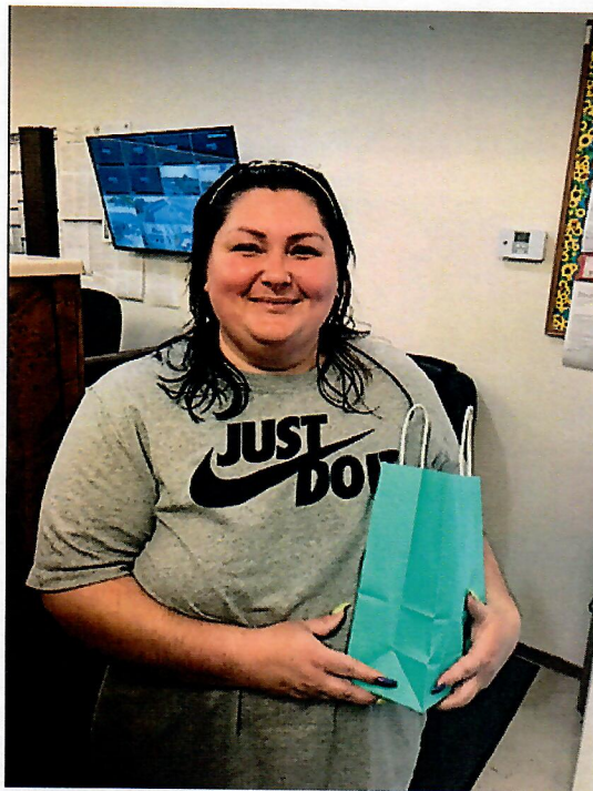
March Raffle Prize Winner