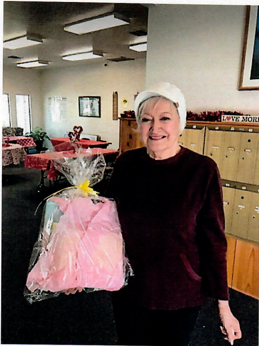
January Raffle Prize Winner