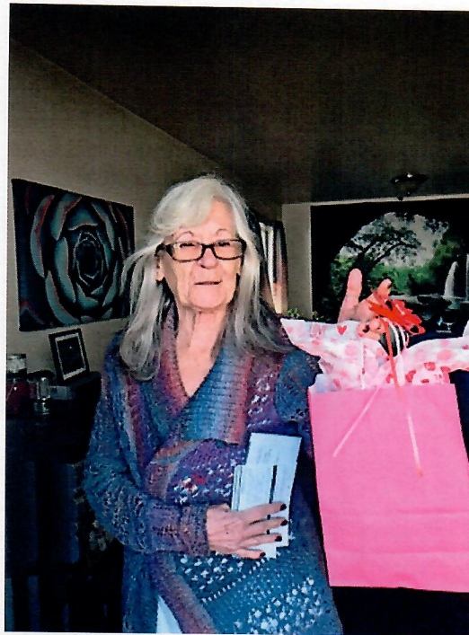
February Raffle Prize Winner