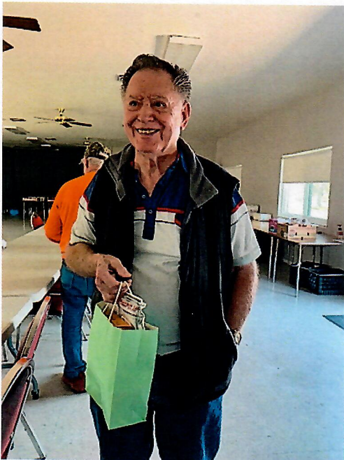
March Raffle Prize Winner