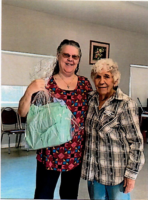
January Raffle Prize Winner