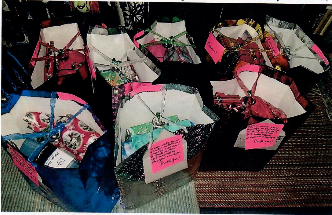
Two of the eight seniors who received gift bags